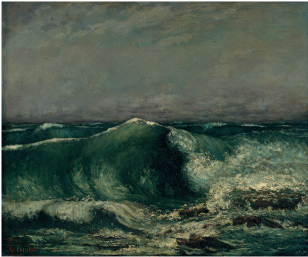
Gustave Courbet (1819–1877) The Wave , 1870 Oil on canvas, 80.5 x 99.5 cm Oskar Reinhart Collection 'Am Römerholz', Winterthur