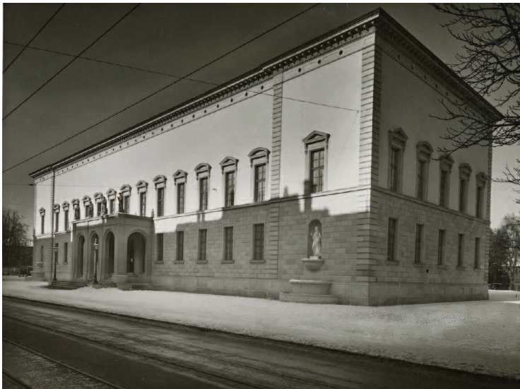
The renovated boys' high school, built between 1838 and 1842 in the town's green belt, designed by the Zurich architect Leonhard Zeugheer (1812–1866) and now home to the Stiftung Oskar Reinhart, anonymous photographer, c. 1960, Museum Oskar Reinhart am Stadtgarten, Winterthur.