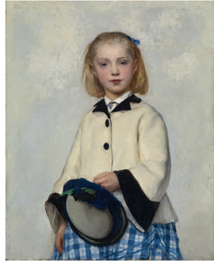
Albert Anker (1831–1910) The Artist's Daughter Louise , 1874 Oil on canvas, 80.5 x 65 cm Museum Oskar Reinhart am Stadtgarten, Winterthur