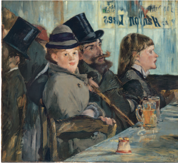
Edouard Manet (1832–1883) Au café , 1878 Oil on canvas, 78 x 84 cm Oskar Reinhart Collection 'Am Römerholz', Winterthur