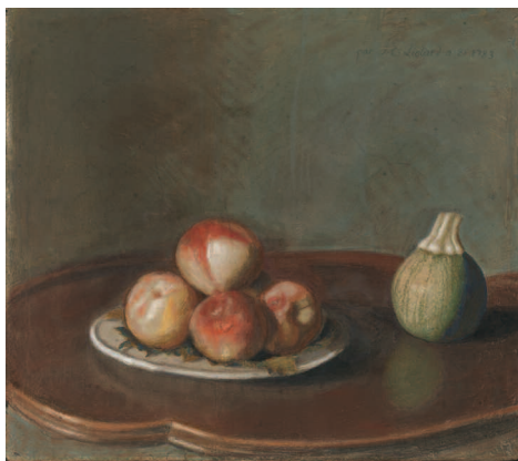
Jean-Etienne Liotard (1702–1789) Still Life with Peaches and Pumpkin , 1783 Pastel on paper, mounted on canvas, 32 x 35.5 cm Museum Oskar Reinhart am Stadtgarten, Winterthur

Any visual materials may only be used for press purposes. Please use the picture details as listed below and supply us with a copy of any published materials for our archives.