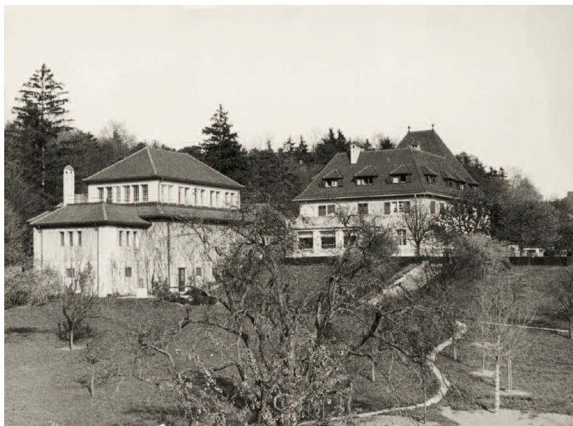
Villa Am Römerholz, built in 1913–16, with the newly constructed picture gallery (1924–25) designed by Maurice Turrettini, photograph by Hermann Linck, Winterthur, c. 1950, Archive of the Oskar Reinhart Collection 'Am Römerholz', Winterthur.