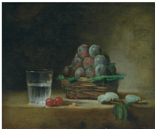
Jean-Siméon Chardin (1699–1779) Still Life with Water Glass and Fruit , 1759 Oil on canvas, 37 x 45.5 cm Oskar Reinhart Collection 'Am Römerholz', Winterthur