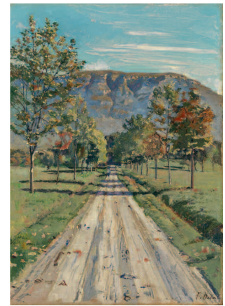
Ferdinand Hodler (1853–1918) The Road to Evordes , c. 1890 Oil on canvas, 62.5 x 44.4 cm Museum Oskar Reinhart am Stadtgarten, Winterthur