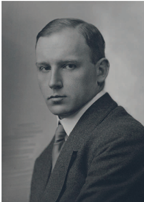
The young Oskar Reinhart (1885–1965), photograph by Hermann Linck (1898–1986), Winterthur, Volkart Fotoarchiv, Fotomuseum Winterthur