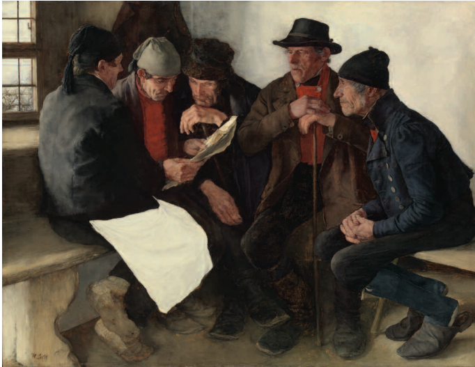
Wilhelm Leibl (1844–1900) Village Politicians , 1877 Oil on panel, 76 x 97 cm Museum Oskar Reinhart am Stadtgarten, Winterthur