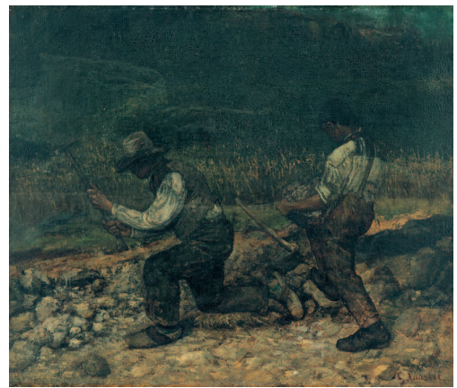
Gustave Courbet (1819–1877) The Stonebreakers , c. 1849 Oil on canvas, 56 x 65 cm Oskar Reinhart Collection 'Am Römerholz', Winterthur