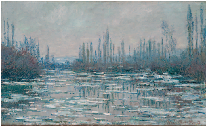
Claude Monet (1840–1926) The Break-up of Ice on the Seine , 1880/81 Oil on canvas, 60 x 99 cm Oskar Reinhart Collection 'Am Römerholz', Winterthur